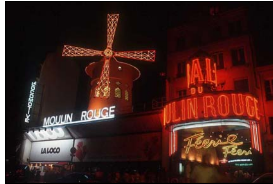
The famous Moulin Rouge at night.

There is NO LANGUAGE REQUIREMENT for this program. Students with little or no French language experience are encouraged to apply.