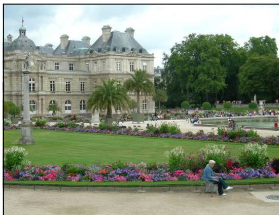
People relaxing at the Luxembourg Gardens in Paris.

JPPF195 INTENSIVE ORAL & WRITTEN FRENCH (4 credits). Introductory French language focusing on practical phrases and comprehension. Taught in French by a Skidmore Center instructor.