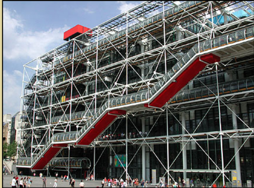
Le Centre Pompidou near the Skidmore Center.

Our program Center is located in the heart of Paris, near the Centre Georges Pompidou, the well-known and vast complex for the arts and culture. The program Center serves as your home base while in Paris; it houses classrooms for program courses, study rooms, computer and video facilities, and a small library.