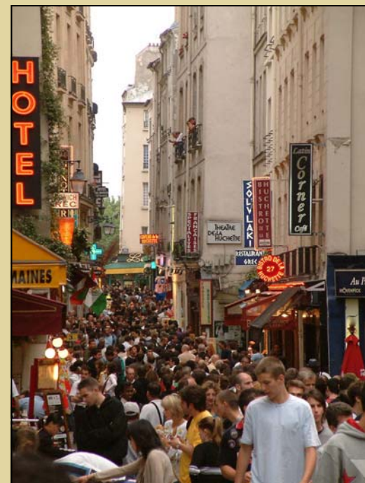
Paris' Quartier Latin (Latin Quarter) is known for its lively atmosphere.